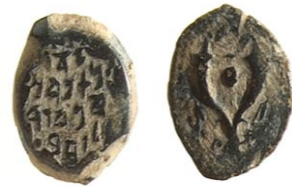
Alexander Jannaeus coin bearing the legend Yehonatan