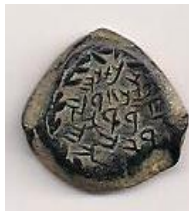
Alexander Jannaeus coin bearing the legend Yntn