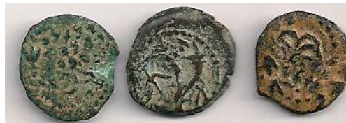
Alexander Jannaeus coins with an overstrike minting